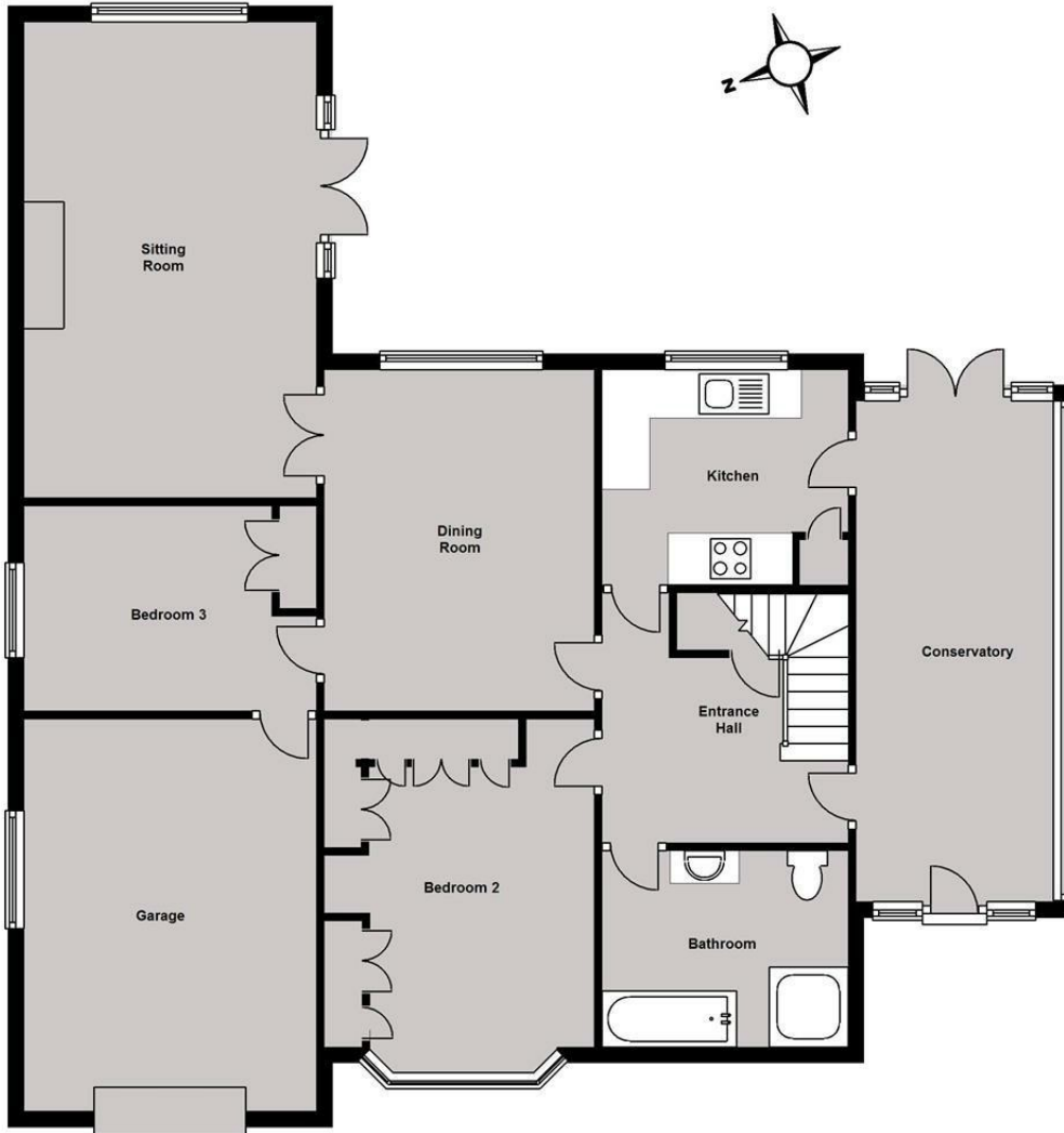
Ground Floor Approx. 122.3 sq. metres (1316.1 sq. feet)